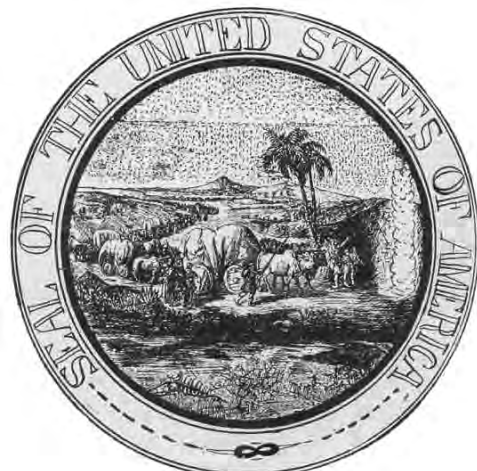
Fig. 1: Thomas Jefferson's Device (Obverse)

Lord went before them by day in a pillar of cloud to lead them along the way, and by night in a pillar of fire to give them light, that