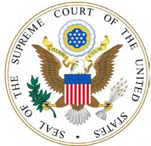
Fig. 14: Supreme Court of the United States