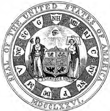
Fig. 5: Du Simitiere Device (Obverse)