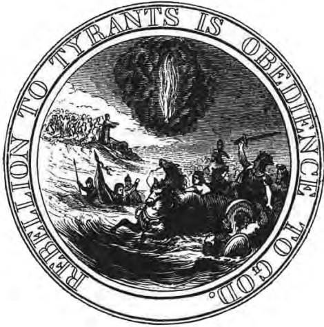
Fig. 4: Benjamin Franklin's Device (Reverse)

Then the waters returned and covered the chariots, the horse-men, and all the army of Pharaoh that came into the sea after them. Not so much as one of them remained."