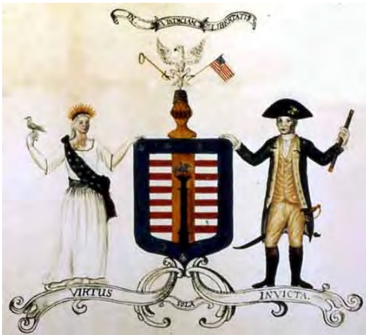
Fig. 8: Barton's Device (Obverse)

1 Shield: Barry of thirteen pieces, Argent & Gules; on a pale, Or, a Pillar of the Doric Order, Vert, reaching from the Base of the Escutcheon to