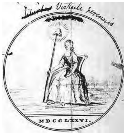
Fig. 7: Hopkinson's Device (Reverse)

Although Congress did not approve the design either, Hopkinson's constellation of 13 stars, shield of 13 stripes, olive branch, and arrows were integrated into the final Great Seal.