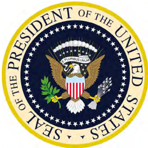
Fig 12: President of the United States

1 Shield- Paleways of thirteen pieces Argent and Gules, a chief Azure; upon the breast of an American eagle displayed holding in his dexter talon an olive branch and in his sinister a bundle of thirteen arrows all Proper, and in his beak a white scroll inscribed “E Pluribus Unum” Sable.