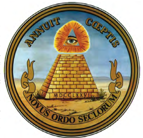
Fig. 11: Reverse

Paleways of thirteen pieces Argent and Gules: a Chief, Azure. The Escutcheon on the breast of the American bald Eagle displayed, proper, holding in his dexter talon an Olive branch,