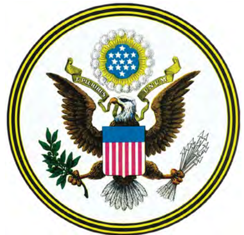
Fig. 10: Arms and Crest

On June 20, 1782, "the Secretary of the United States in Congress assembled to whom were referred the several reports of committees on the device for a great seal, to take order, reports That the Device for an Armorial Achievement & Reverse of the great seal for the United States in Congress assembled is as follows:"(11)