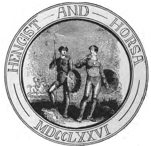
Fig. 2: Thomas Jefferson's Device (Reverse)

Jefferson's reverse side portrayed Hengist and Horsa, the two brothers who were the legendary leaders of the first Anglo-Saxon settlers in Britain (Fig. 2).