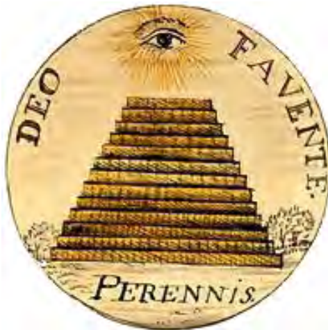
Fig. 9: Barton's Device (Reverse)

b. Sinister - an American Warrior; clad in a uniform