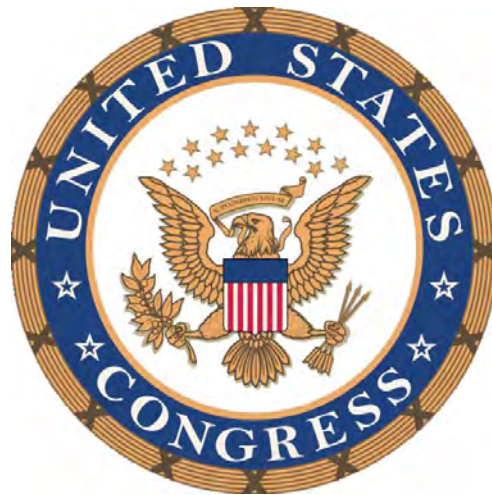
Fig. 13: United States Congress

The Seal of the President of the United States shall consist of the Coat of Arms encircled by the words “Seal of the President of the United States.”