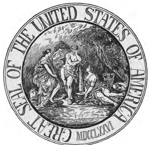
Fig. 3: John Adams' Device

Adam's device portrayed Hercules' “choice” taking place at a pivotal moment in the adventure- on “the road of trials” between the “meeting with the goddess” and “woman as temptress before the hero achieves “atonement with the father” and ultimately, “apotheosis.”(5)